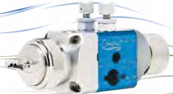
Compact Automatic I

Available in Trans-Tech, HVLP and Advanced Conventional