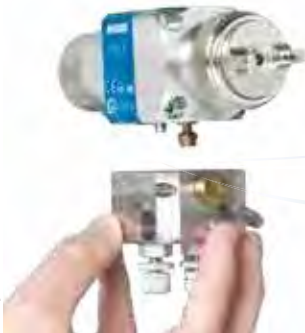
Compact Automatic X

All the features of the Compact Automatic "I" plus fast & easy removal from the mounting block.