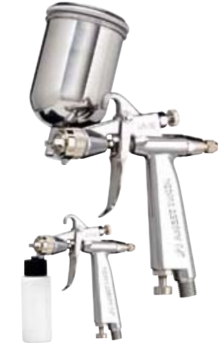
LPH50 shown with #6022 airbrush bottle adapter kit