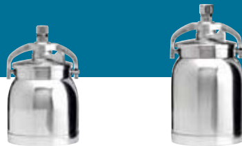
PCL 7B3 #6021 700ml Aluminum W200S ONLY