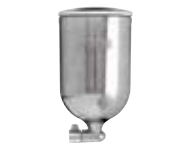
PC4S #6008 400ml Aluminum Cup